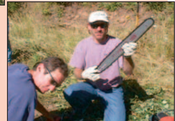
These guy's know bars and chains!