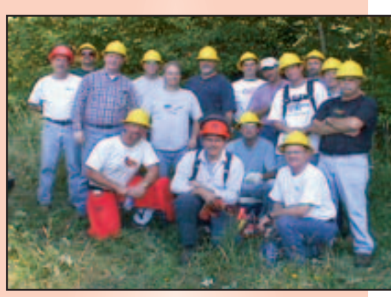
The Oregon 2002 Crew!

Forest Applications Training is proud to have Blount Inc. - Oregon® Cutting Systems sponsoring this newsletter and our training around the country. Thank You!